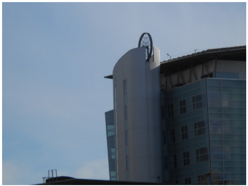
Fig. 1. The elevator wheel atop the town hall in Kerkade.