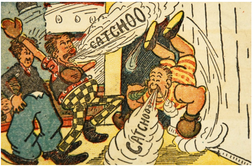
Fig. 3: Comic strip panel from Charlie Chaplin's Funny Stunts . Courtesy of the Bill Douglas Cinema Museum, Exeter, EXEBD42889

Throughout the Scream Book, stories about Charlie venturing to Algiers, becoming a detective and various other short comic episodes are all presented, but none of the narratives in which Charlie is depicted can be said to resemble those of his films. However, the manner in which the book is constructed is significant due to the fact that its series of unconnected stories mirrors the manner in which the film texts themselves were released as autonomous, standalone texts. Whilst the stories themselves may echo or reference familiar gags or routines, such as the kicking gag in 'l Discover Charlie', the contexts in which Charlie finds himself are wholly original.