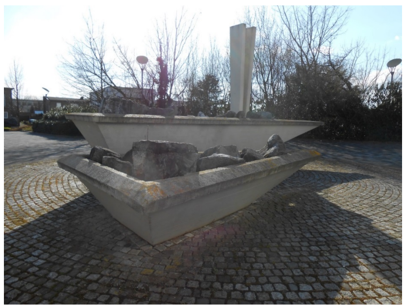
Fig. 3. The artwork next to the Rodahal.