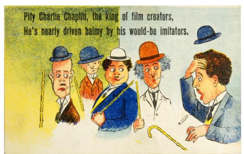
Fig. 2: 'Pity Charlie Chaplin' Postcard.