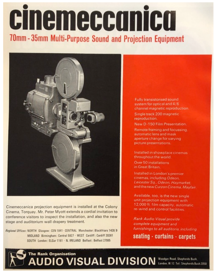
Figure 3: Cinemeccanica projector advert from a Cinematograph Exhibitors' Association of Great Britain and Ireland Conference programme, 23-25 May 1966, Torquay. Bill Douglas Cinema Museum, EXEBD 55701

Interviewer: one of the most well-known wide-screen technologies is probably IMAX. Would you be able to tell us a bit more about the history of IMAX?