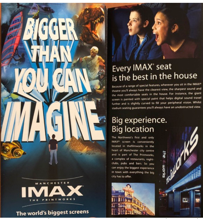
Figure 4: 'Bigger than you can imagine': Manchester IMAX: The Printworks Handbill, BDCM, EXEBD 44363

Printworks, operated by Vue since 2017, remains one of a decreasing number of venues able to show IMAX in its native 70mm format on what is reported to be Europe's second largest cinema screen. However, Vue's heavy investment in laser projection in 2018, installed just before the premiere of Fantastic Beasts: The Crimes of Grindelwald (David Yates, 2018), shows that the creation of niche digital benchmarks to sell mainstream features remains the order of the day.